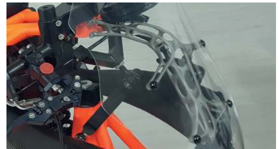
Mounted windshield bracket

Visit the Altair Library of Customer Stories at altair.com