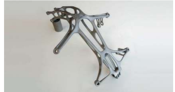
Final design of the windshield bracket