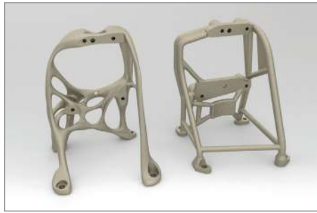
Optimized and 3D printed metal aerospace bracket