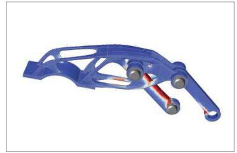
Analysis of an optimized robot gripper arm