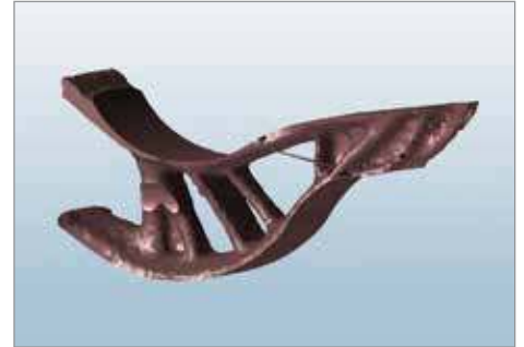
Inspire generated ideal shape for the part