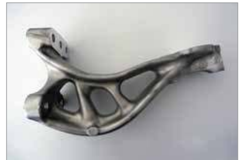
Final part forged by LEIBER