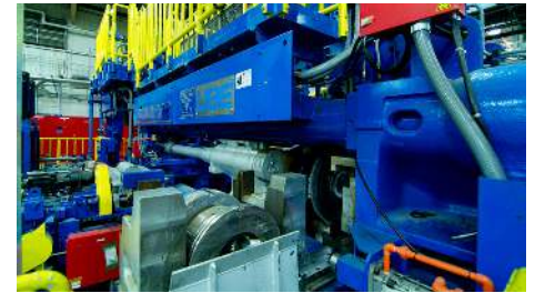
APEL Extrusions Limited Extrusion Press